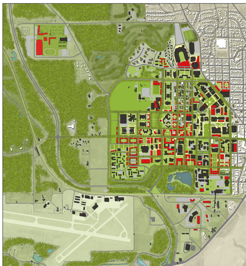
MAP IMAGE BY SASAKI ASSOCIATES

Another part of State Street’s transformation would involve downgrading the busy thoroughfare from a state highway to a