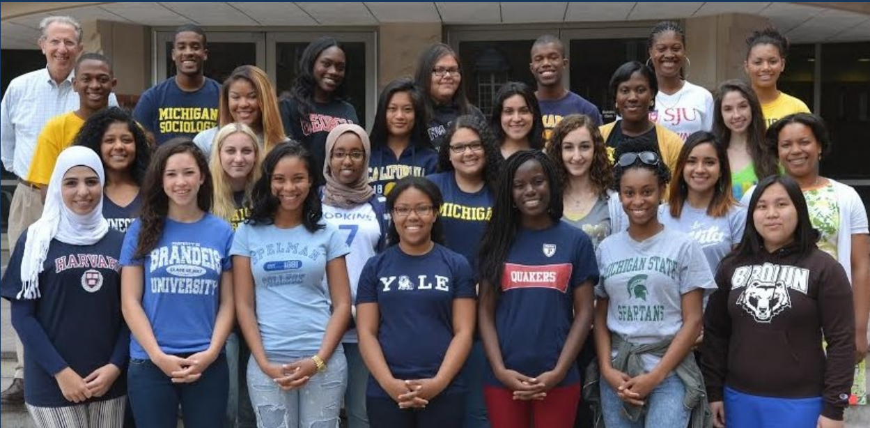
UM SEP 2015 Interns

Since 1986, the University of Michigan Summer Enrichment Program (UM SEP ) in Health Management and Policy has attracted undergraduate students who seek to improve the health status and health care of underserved communities across the United States. UM SEP partners with Michigan hospitals and other health care organizations in Detroit and Ann Arbor to provide a paid eight week summer internship and to expose students to the health care field and health issues that persist today.