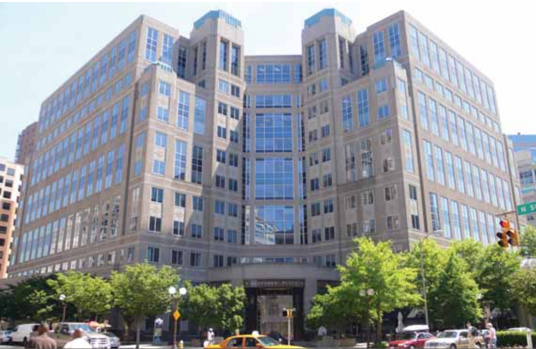
NSF Building 4201 Wilson Boulevard Arlington, Virginia