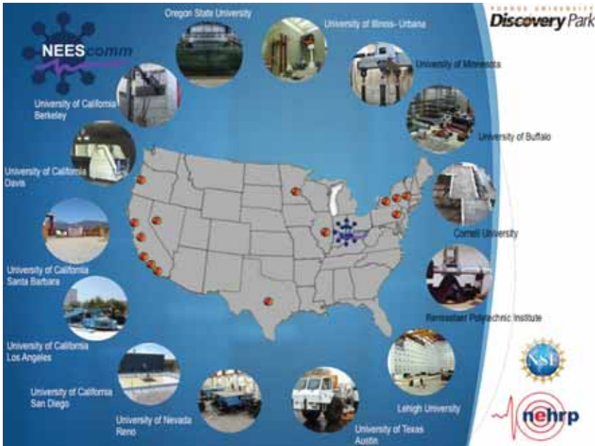
NEES equipment sites