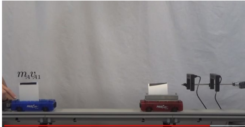
Figure 3. A screenshot from a representative Visualizing Mechanics video.