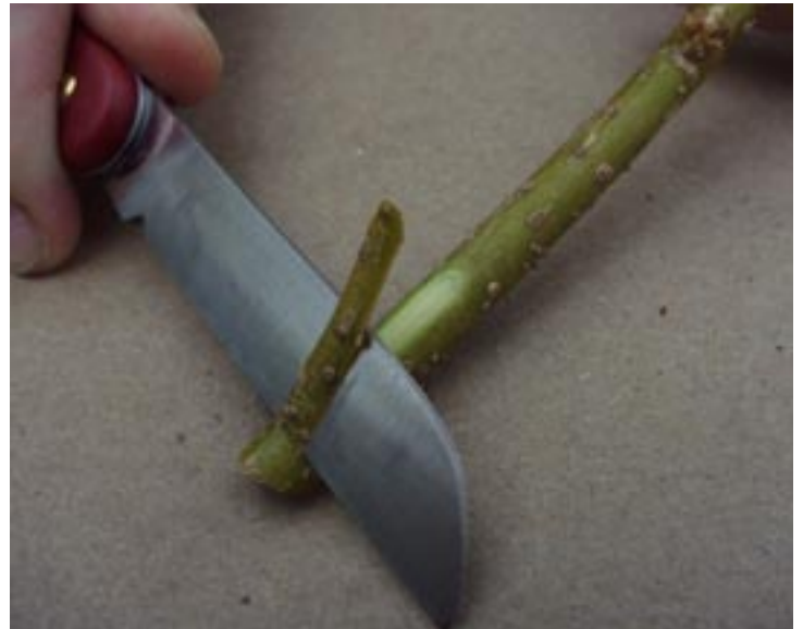
Figure 6: Hardwood: wounding