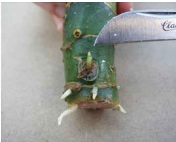
Figure 9: Cane: Dieffenbachia bud and roots