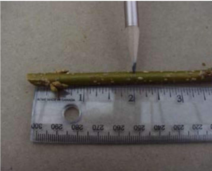
Figure 5: Hardwood: 2-inch mark