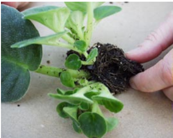
Figure 13: Leaf petiole: rooted cutting with plantlets