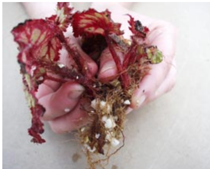
Figure 20: Leaf blade: separating Rex begonia plantlets