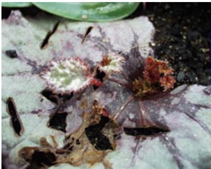
Figure 19: Leaf blade: Rex begonia leaf with plantlets