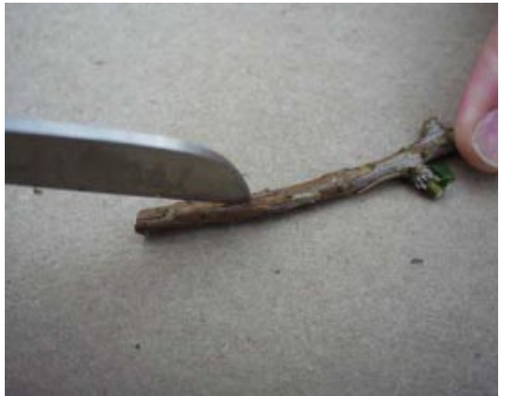
Figure 8: Needled evergreen: wounding