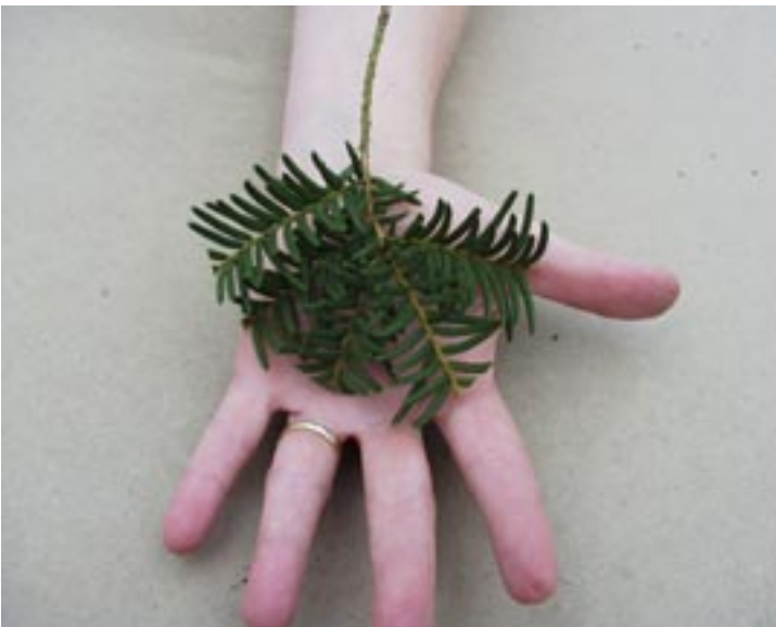
Figure 7: Needled evergreen: trimmed needles