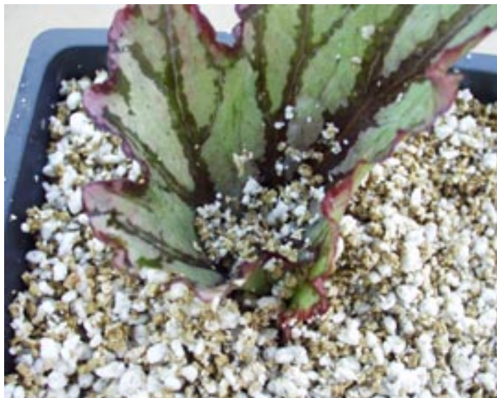
Figure 18: Leaf blade: Rex begonia leaf rolled and stuck in medium