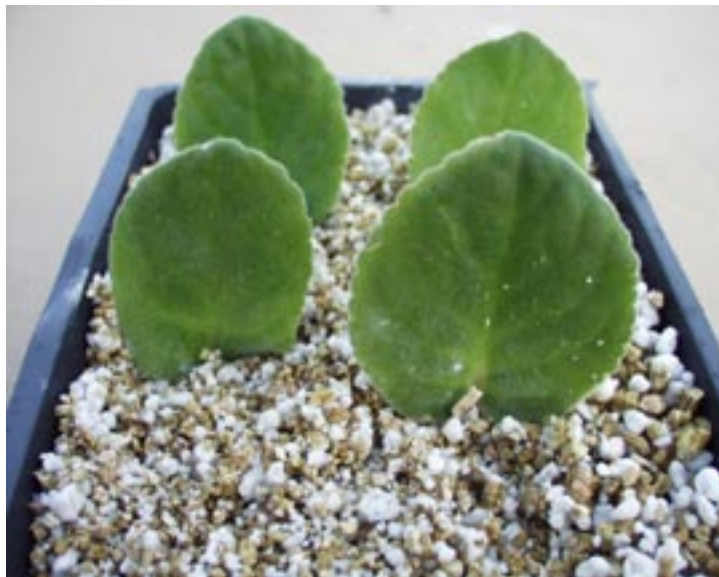
Figure 12: Leaf petiole: leaf blades stuck in medium