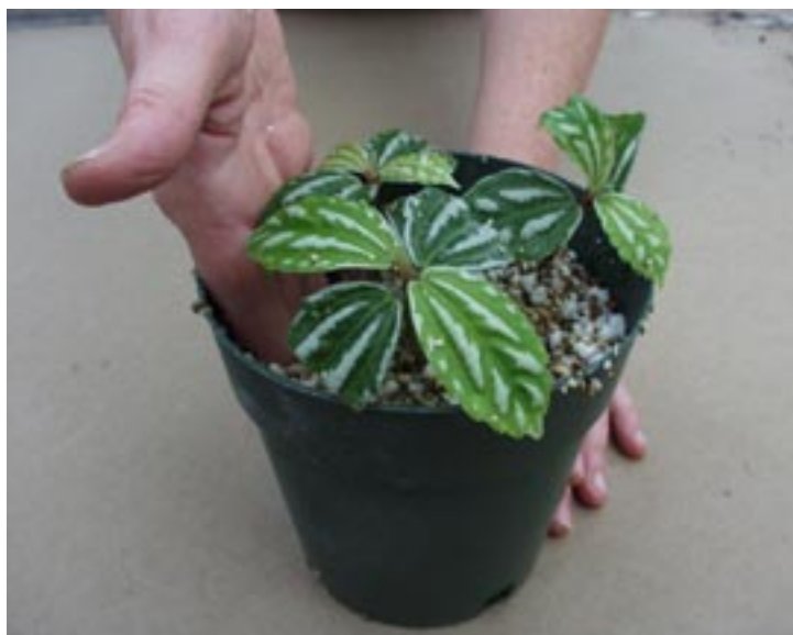
Figure 3: Herbaceous and softwood: checking for roots