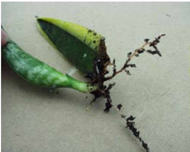
Figure 21: Leaf section: rooted and growing Sansevieria section

*Janie Nordstrom Griffiths assisted in the preparation of this publication.