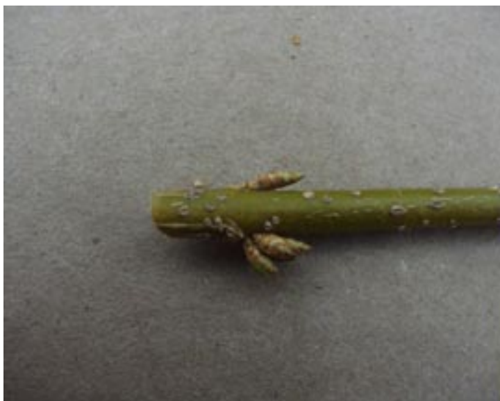
Figure 4: Hardwood: cutting below a node