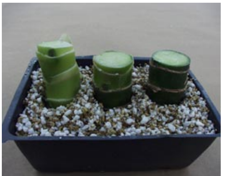
Figure 10: Cane: Dieffenbachia segments placed vertically