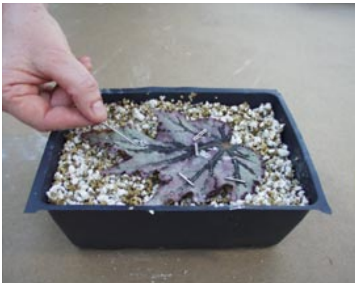
Figure 17: Leaf blade: Rex begonia leaf pinned flat