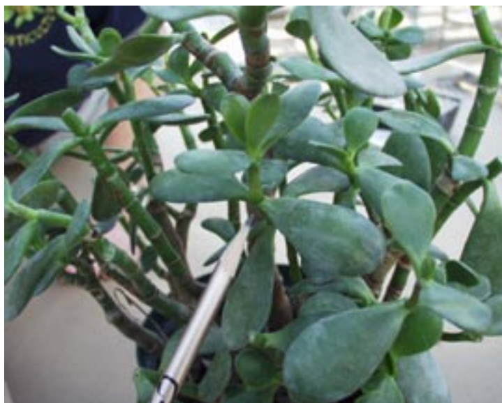
Figure 14: Leaf blade: succulent leaves with no petioles