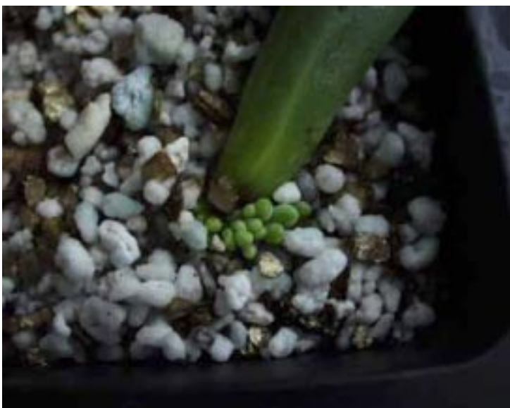
Figure 15: Leaf blade: succulent leaf with plantlets