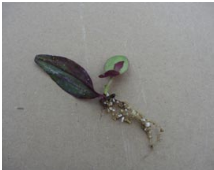
Figure 11: Leaf-bud: rooted cutting