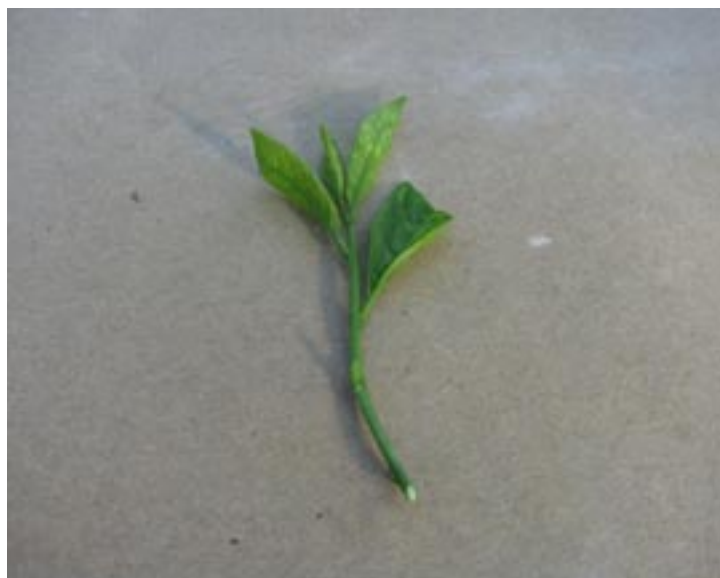
Figure 2: Herbaceous and softwood: trimmed shoot tip