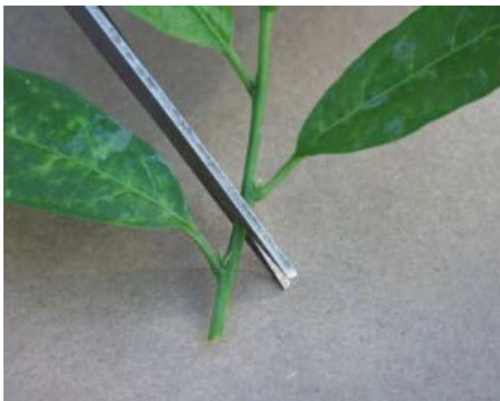
Figure 1: Herbaceous and softwood: cutting below a node

Note: The figures in this publication are references for HO-37: "New Plants from Cuttings," available at http://www.hort.purdue.edu/ext/HO-37.pdf .