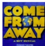
Come From Away