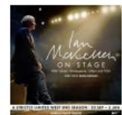
Ian McKellen On Stage: With Tolkien, Shakespeare, Others and YOU