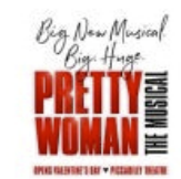
Pretty Woman: The Musical