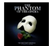
The Phantom of the Opera