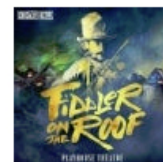
Fiddler on the Roof