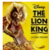
Disney's The Lion King