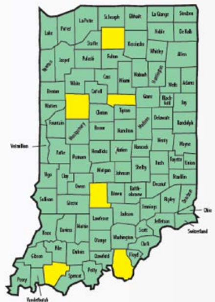
Figure 1. Counties with farmers markets participating in the Purdue Horticulture Business project in 2017 are in yellow.

Farmers markets participating in 2017 included Bloomington (Monroe County); Boonville (Warrick County); Corydon (Harrison County); Culver and Plymouth (Marshall County); Kokomo (Howard County); and Lafayette and West Lafayette (Tippecanoe County). Figure 1 illustrates the county location of the nine farmers markets located in 8 counties. See Torres and Pinto (2018) for more information on how the data was collected.