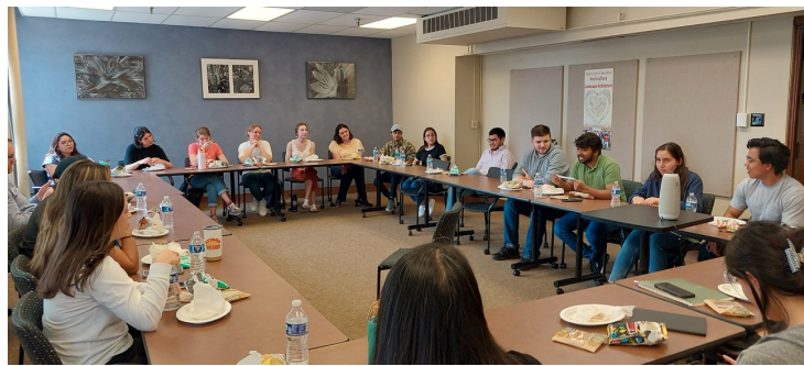
HLA celebrated graduate students' contributions, impact, and value by hosting the 2024 Graduate Appreciation Lunch.

Congratulations to our undergraduate students recognized by ASHS!