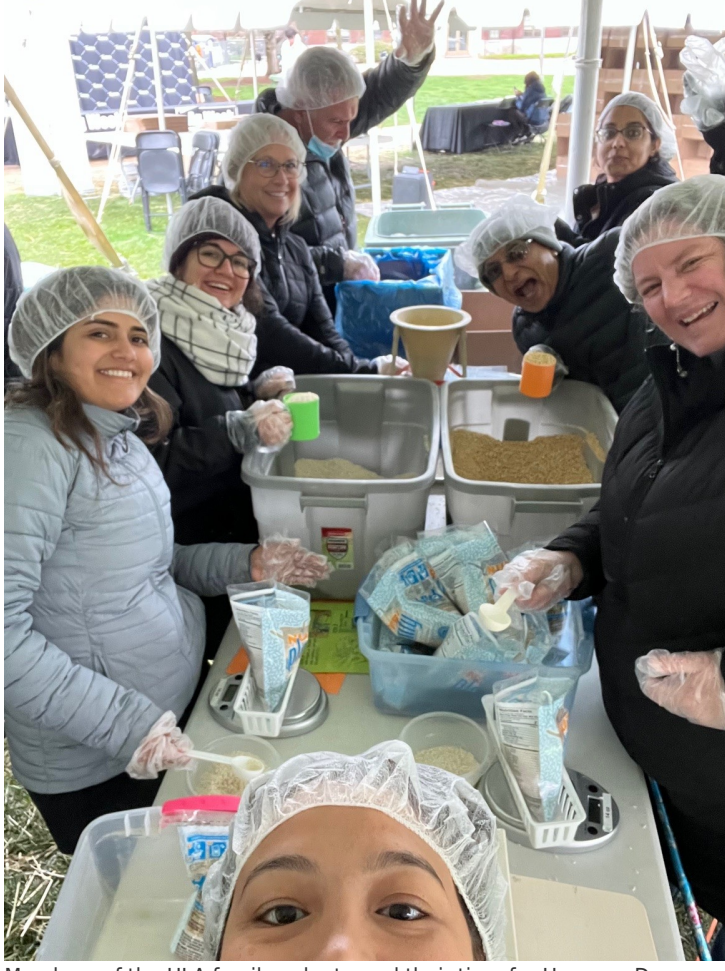
Members of the HLA family volunteered their time for Hammer Down Hunger during Purdue's Ag Week.