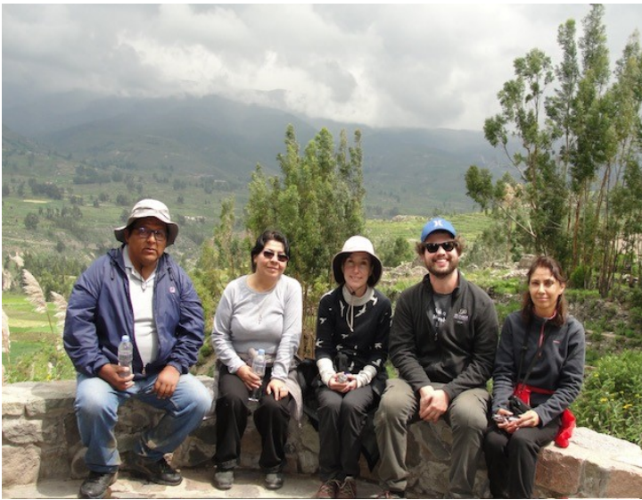
The team taking a quick break while hiking up to some pre-Incan ruins on the last day of the two-week trip

More photos from the trip can be viewed in this gallery .