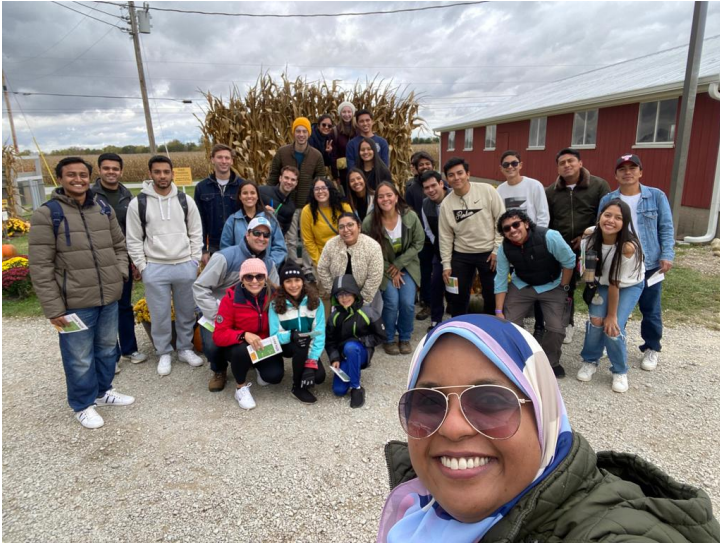
HLA graduate students spent last Sunday exploring the corn maze and other activities at Exploration Acres.