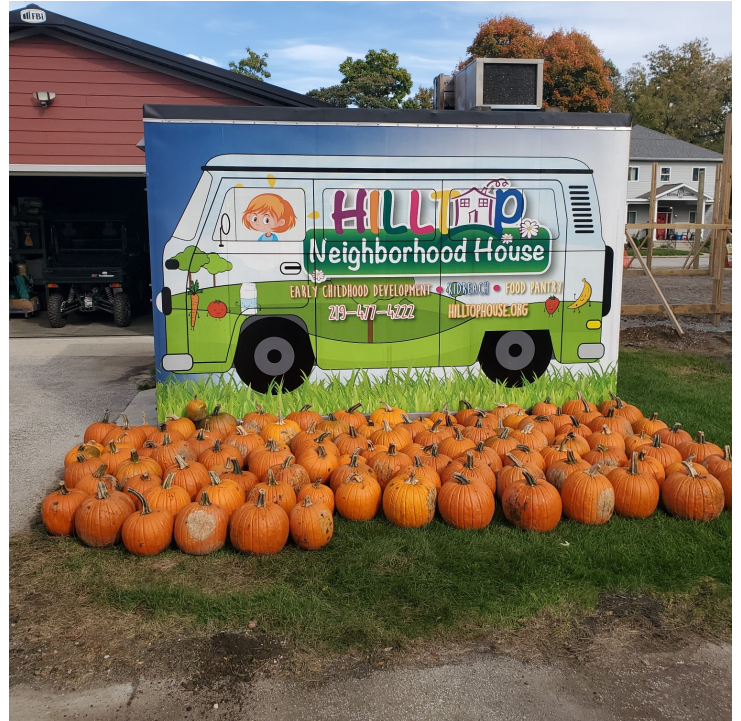
Volunteers loaded pumpkins from plots at Pinney Purdue and took them to Hilltop House and other food pantries serving NW Indiana.