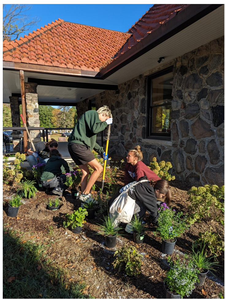
The Hort 317 (Landscape Contracting and Management) class installed plants and mulch at the renovated caretaker's cottage at Grandview Cemetery on October 6.