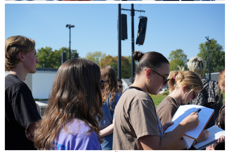
HORT 317 Students Gain Experience While Giving Back to the Community