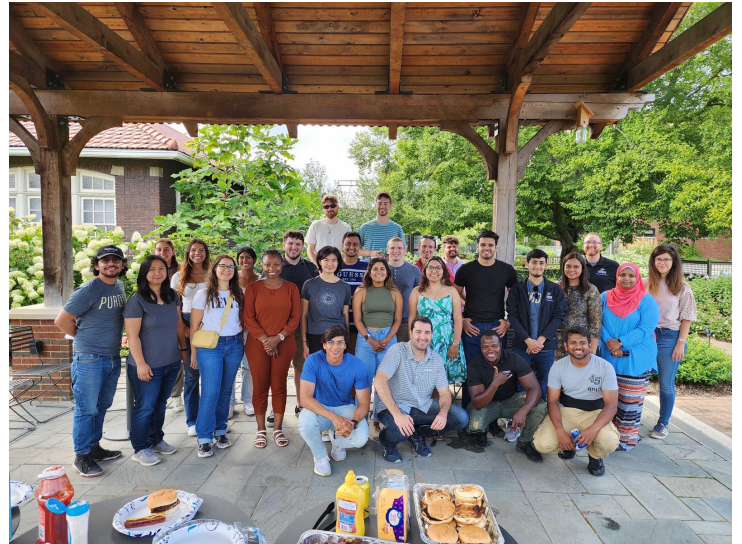
The HLA Graduate Students hosted a welcome back barbecue on August 17.