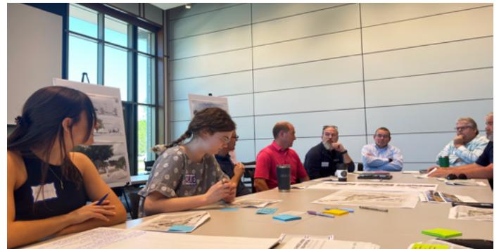
Presenting to Carmel Clay Parks and Recreation staffs and Carmel City planners and engineers.