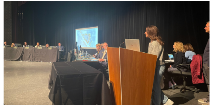
Presenting to the Carmel Clay School Board