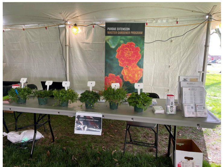
Purdue Extension Master Gardener's weed quiz set-up.