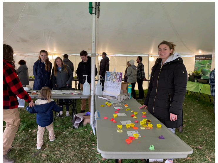
PASLA members teaching children about landscape architecture.