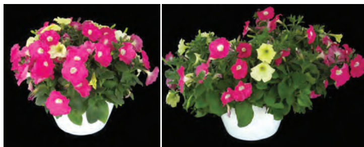
Petunia Flirtini hanging baskets show the growth in a high tunnel basket (left) and greenhouse (right).

At Cornell, the high tunnel baskets had about the same number of flowers as the greenhouse baskets by May 27. The greenhouse baskets, however, were much larger in terms of their branch spread. Plants in