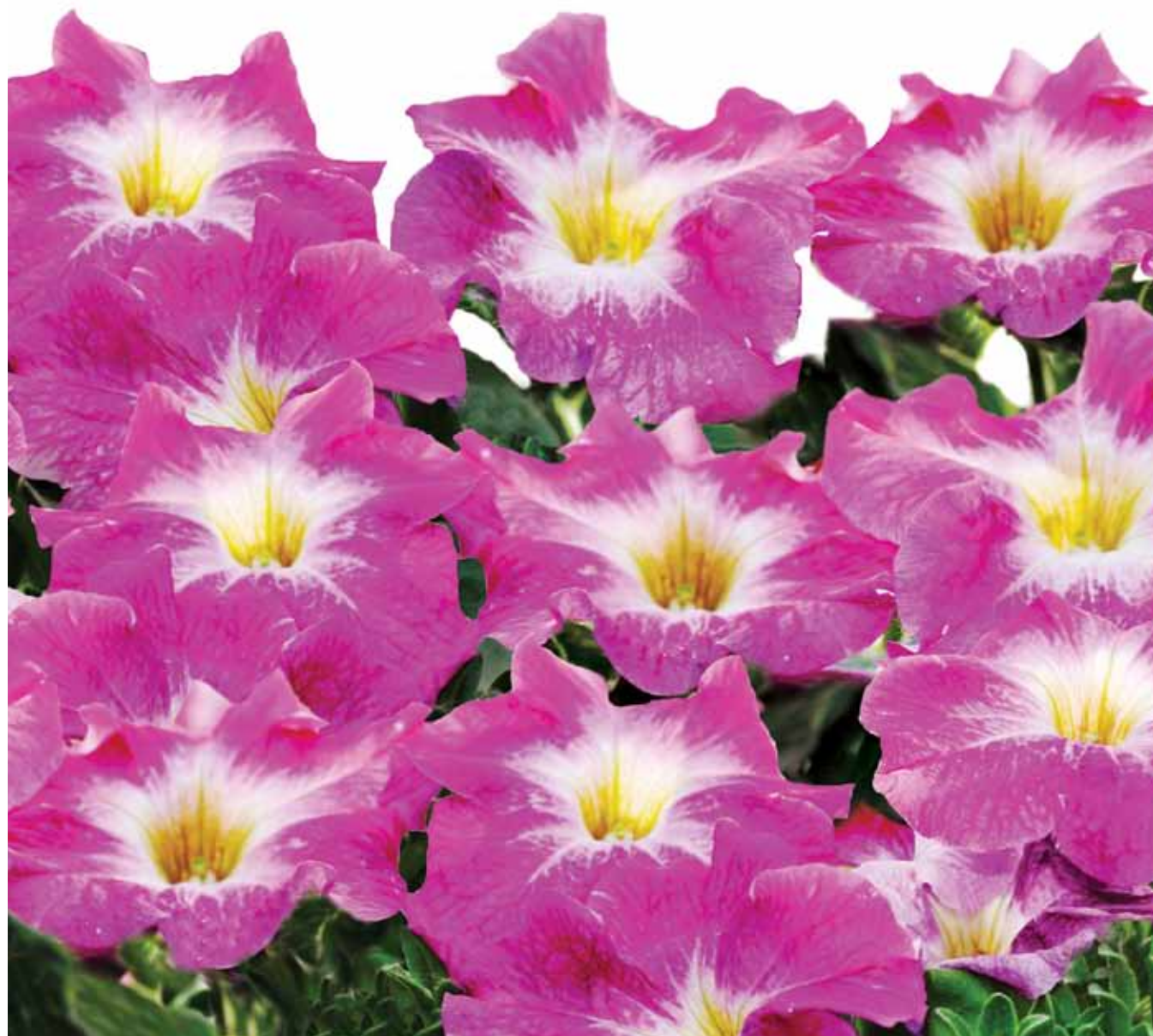
Write in 768