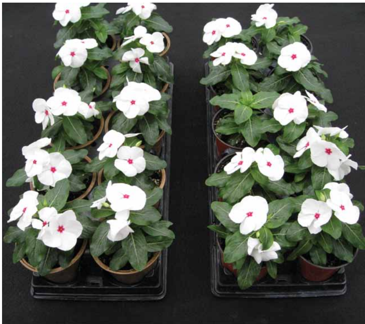
Figure 1. Trays of sustainably produced vinca (left) and conventionally produced vinca (right) were delivered to five garden centers across Indiana.

We started out our quest to understand grower perceptions and challenges producers faced when deciding to adopt sustainable practices. In 2008, Purdue University conducted a