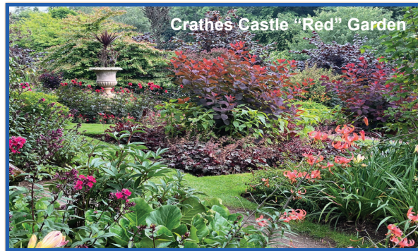
Crathes Castle "Red" Garden

Tuesday, July 2 – Pitmuies, a charming country garden enchants our morning. If available, we'll briefly explore the remnants of the Edzell Castle walled garden. Later, we explore Crathes Castle Garden, an ancient walled garden that was redesigned in the style of Gertrude Jekyll in the early 20th century. (B,L,D)