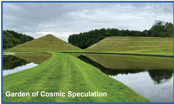
Garden of Cosmic Speculation

Sunday, June 30 – FREE DAY in Edinburgh to shop, or take in Edinburgh Castle, Old Town, the royal yacht Britannia, Holyrood Palace, museums, the Scotch Whiskey Experience (!) or spend more time at the Royal Botanic Garden. (B)