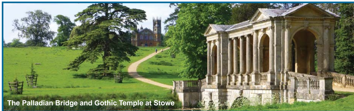
The Palladian Bridge and Gothic Temple at Stowe

Required Reading (distributed to participants just prior to commencement of course):