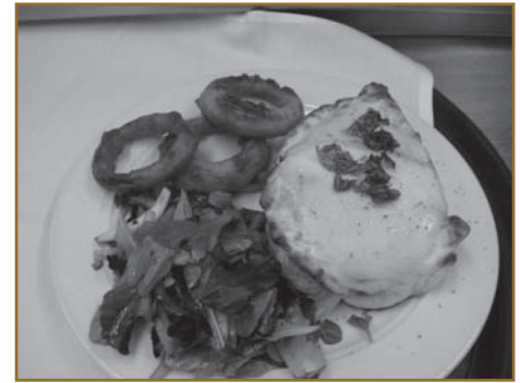
A Cajun chicken parmesan sandwich with homemade onion rings blended Asian and European influences for an East-meets-West themed fusion lunch this spring.

"This is exactly the kind of management experience we are trying