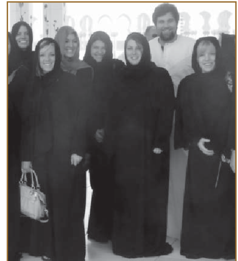
For many of the students on the Dubai trip, it was their first time out of the United States on New Year's Day.