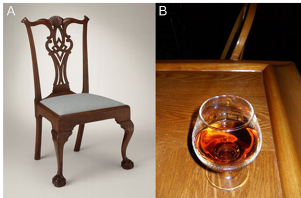
Fig. 2. Example of the pictures shown to the subjects during MRS scans. (A) Furniture and (B) alcoholic beverage.

shown to the subjects in a random order repeatedly. Each picture was displayed for 2 s. These pictures were changed to pictures of alcoholic beverages (Lovett et al. , 2015) (Fig. 2B) and were displayed in the same fashion in the last two MRS scans until the scan ended. The order of the MRS scan was ACC–NAc–NAc–ACC to minimize the shimming effort when switching voxel location. After the last MRS scan, the subjects were asked to rate their craving on a scale of 1–5 with 1 meaning little to no craving and 5 meaning extreme craving. Because of the difficulty in positioning the voxel in the NAc that allows for non-noisy data, only the ACC data are presented due to poor spectra quality of the NAc data.