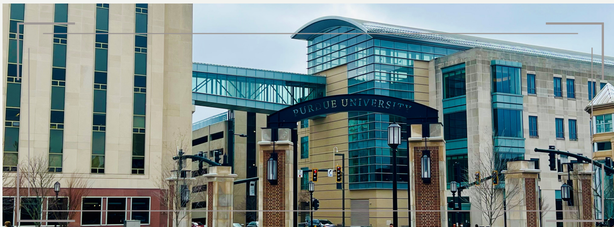
Krannert and Rawls Hall connected by a skywalk at Purdue's Gateway Arch

Purdue is known for its 27 astronauts that are Boilermakers!