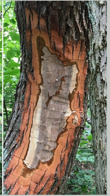
Staining under the bark