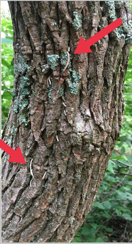
"Noodles" from beetle activity