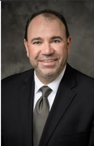
Eric Barker Pharmacy