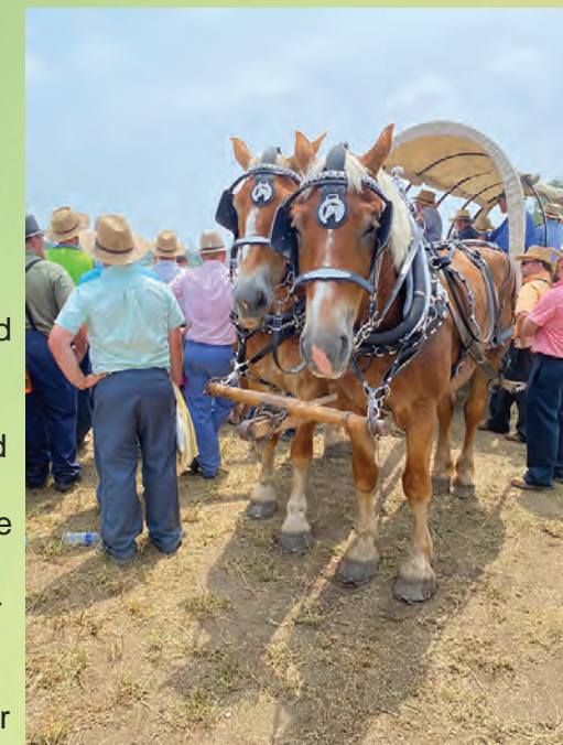
Draft horses ready to roll at Horse Progress Days