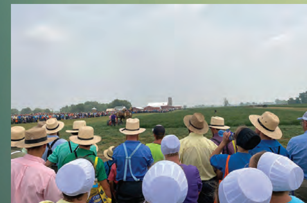
Old Order community members observing field trials at Horse Progress Days

with the Amish because of their refreshing lack of pretense and need for standing upon personal academic or other credentials. Their desire to get to know me as a person to see if I can be trusted and their willingness to share their questions and needs once that trust is given is rewarding in itself."