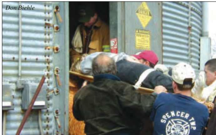
A "victim" is removed from a grain bin during a staged training drill.

When reporting an injury, provide the 911 dispatcher with as much of the following information as possible: