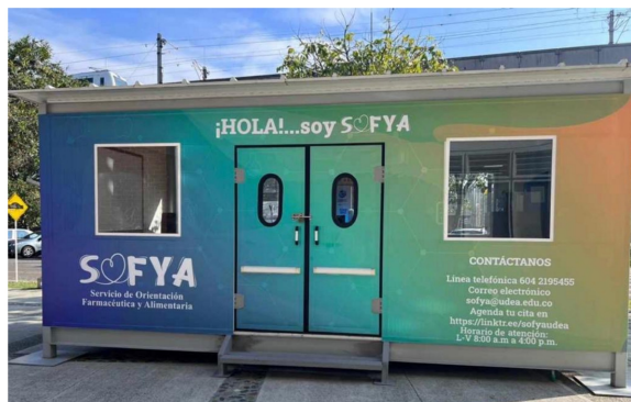
A physical SOFYA building located on the UdeA campus.

Servicio Orientación Farmacéutico y Alimentaria (SOFYA) is a health and wellness program situated at the University of Antioquia (UdeA) in Medellín, Colombia. Established in 2022, this organization, comprising various health professions, aims to offer education and training on medication and health-related subjects to both university students and the neighboring community. These communities face challenges such as limited education, low health literacy, and numerous barriers in addressing social determinants of health. SOFYA's initiatives encompass medication education, menstrual hygiene, preventive health screenings, and interactive health and nutrition education activities.