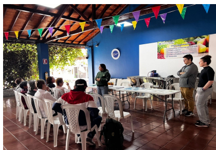
Purdue students volunteering at a community engagement event, Nov 2023

Purdue Doctor of Pharmacy (PharmD) students had the opportunity to start working closely with administrators and volunteers at SOFYA. As this is a new relationship being formed PharmD students were able to engage in a wide variety of activities with SOFYA to better understand the impact future PharmD students can have. In the first year this included providing recommendations of care to patients of SOFYA, participating at the SOFYA drop-in center, and volunteering at educational workshops with students and faculty of UdeA.