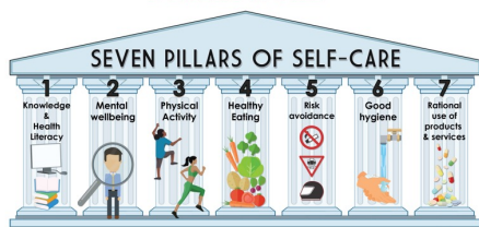
Framework for SOFYA engagement activities & focused initiatives within community