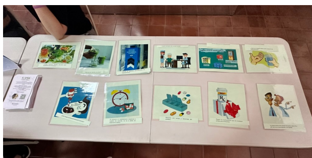
An activity used to educate patients on various medication related topics, Nov 2023

As this was the first year students were able to collaborate with SOFYA, both groups gained valuable insights into the potential of this partnership for future endeavors. The grant provided crucial support to SOFYA, enabling the distribution of educational materials created by students, along with promotional content for community events. As SOFYA progresses, their vision includes sustaining educational initiatives and community events, while also expanding avenues for patient engagement through courses and events hosted on the UdeA campus.