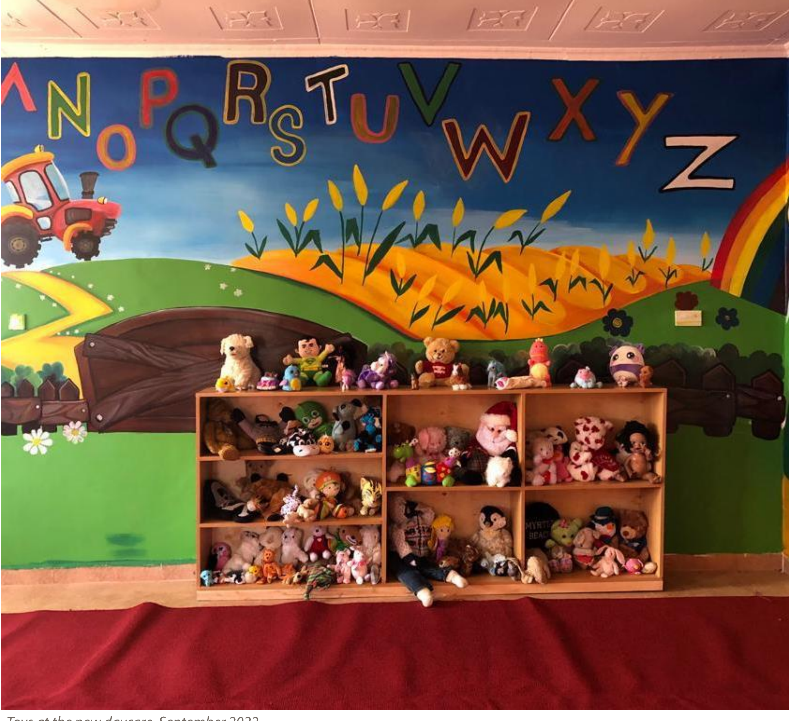
Toys at the new daycare, September 2022.