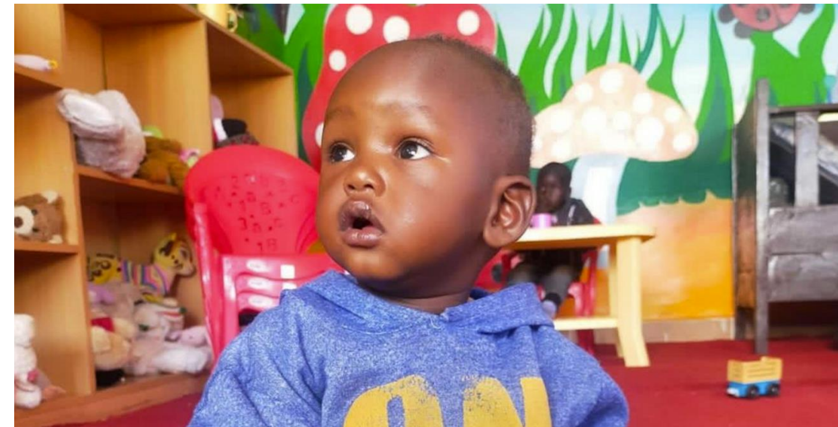
One of the six children enrolled in the day care, September 2022.