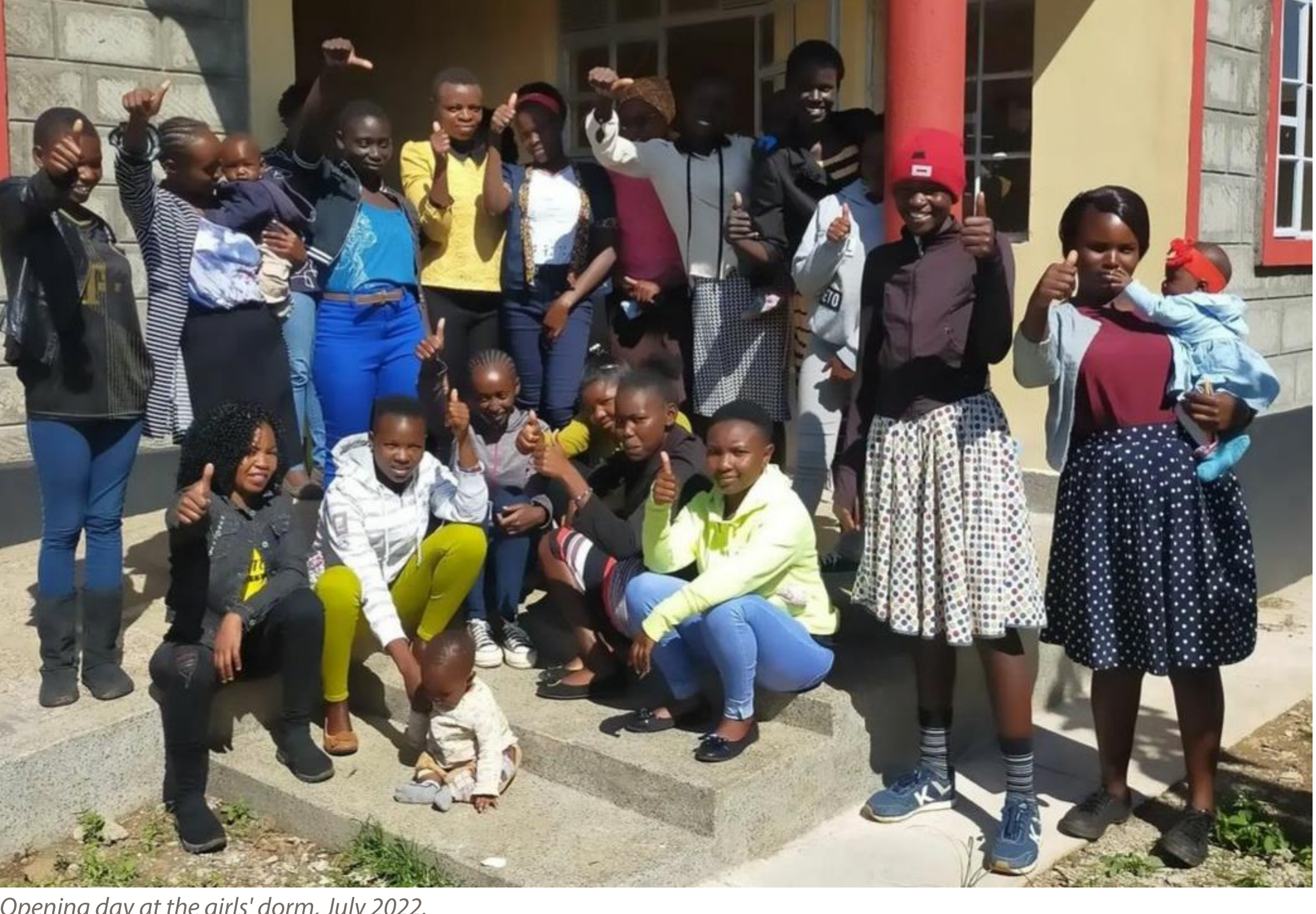
Opening day at the girls' dorm, July 2022.

With the opening of a new dorm this year, young women and their children were finally able to be accommodated in the center, which included sixteen young women who are enrolled in vocational training and are boarding at TIC. The grant supported a new daycare center at TIC so mothers could engage in vocational training. The center has started with six babies who are below the age of ten months with plans to expand as resources continue to grow.