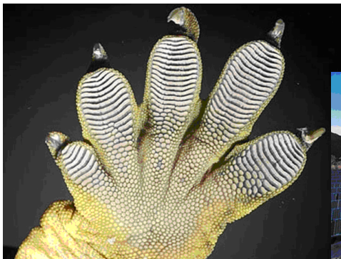
A New Adhesive That's Even

PIs/co-PI's can creatively showcase their work by uploading images with the report!