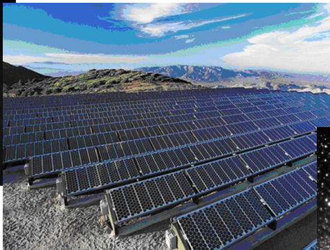
Researchers Produce More Efficient Solar Cells