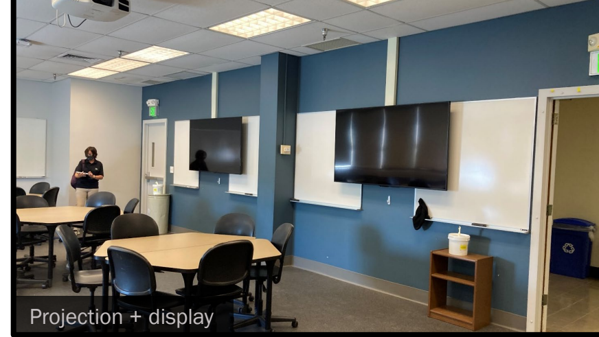
Projection + display