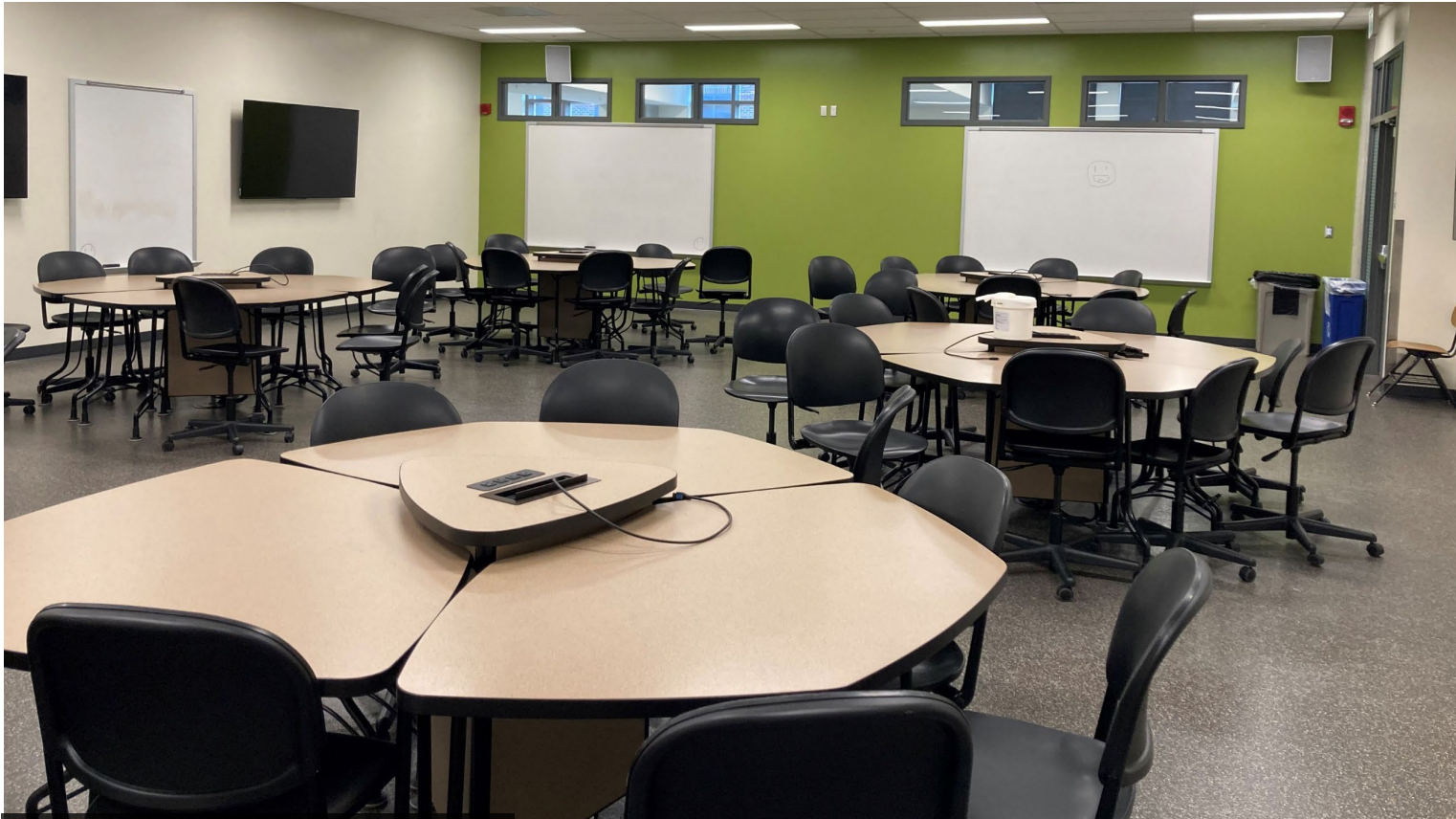
Ability to move around the classroom