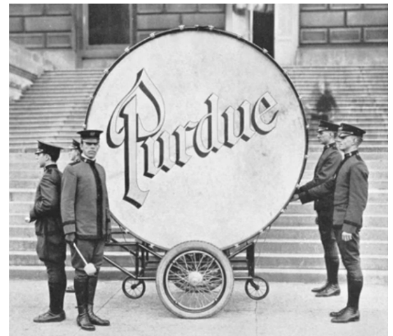
The Purdue Big Bass Drum making its first appearance at the steps of the Indiana State Capitol building in 1921.

At the time, most people thought Emrick's plan was ridiculous and considered it to be impossible. That is, until Ulysses Leedy of the Leedy Drum Corporation, now known as Ludwig Drums, volunteered to craft the massive instrument. Leedy was the largest drum manufacturer in the world and recognized the publicity the drum would bring to the company. Before constructing the instrument, Leedy first had to find materials large enough for the drumheads.