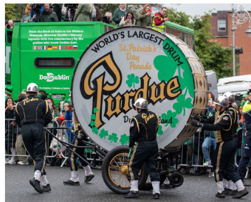
The Drum Crew during the St. Patrick's Day Parade in Ireland in 2023.