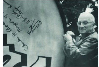
The United States' 33rd President Harry Truman signing one of our drumheads.