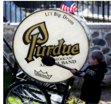
The crew letting a young fan hit the "Lil Big Bass Drum," which is used for alumni events and other gigs.

Crew Members can expect to be photographed and videotaped many times throughout the course of the marching season and whenever with the Drum. We allow people to be photographed with the Drum, but under no circumstances are people allowed to be photographed in front of the Drum with alcohol or tobacco products. These products must be set to the side and outside of the photo. Patrons cannot hide them behind themselves or the Drum, it must be out of the picture entirely. Since the Drum is an icon of Purdue, a photo of the Drum with alcohol or tobacco products could be construed as the University supporting their use. The Crew reserves the right to deny a picture to any person who does not comply with these rules. We often allow people to pose with the beaters, however we ask them not to hit the Drum. If you do notice them hitting the drum and are in a position to stop it, do so by grabbing the beater and responding politely.