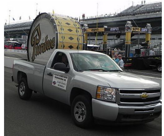
The Drum in the back of the band truck doing laps around the track before the Indianapolis 500 in 2011.

In 1976, the Drum fell out of the pick-up truck mid-transit and rolled down the shoulder of the highway. At the last second, it turned into oncoming traffic with one drumhead in the way of an oncoming semi-truck. The two collided, causing damage to the semi's engine and grill area, but the Drum was relatively unharmed. The head and rim on one side were damaged, but the shell was left intact.