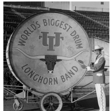
Big Bertha at UT Austin