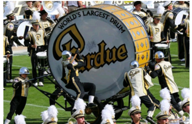
The Drum Crew performing "spins" and "kick-hits" inside the block-P during the pre-game show.

Captains' Note: Drum handling is a component you will be tested on that you cannot practice before auditions. For this reason, we will focus on this component the most during band camp. If you want exposure or practice with drum handling before band camp, I highly recommend that you join us for tech weekend. For the audition, the Captains will select groups and you will perform basic maneuvers in one of the four different positions on the drum. Depending on how many auditionees are present, you may not be tested in every position for the final audition. The Captains are looking for correctness and confidence whilst handling the drum and calling out commands.