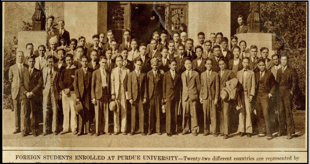
International students at Purdue, 1930

Working hands-on in Purdue's Archives and Special Collections, students will pursue original archival research using historical documents, photographs, and artifacts. The course provides an introduction to archival practice, through the lens of learning about diversity and social justice issues impacting student life at Purdue. Final student projects will be showcased during Purdue's 150 th anniversary via student-led creations of digital archival exhibits.