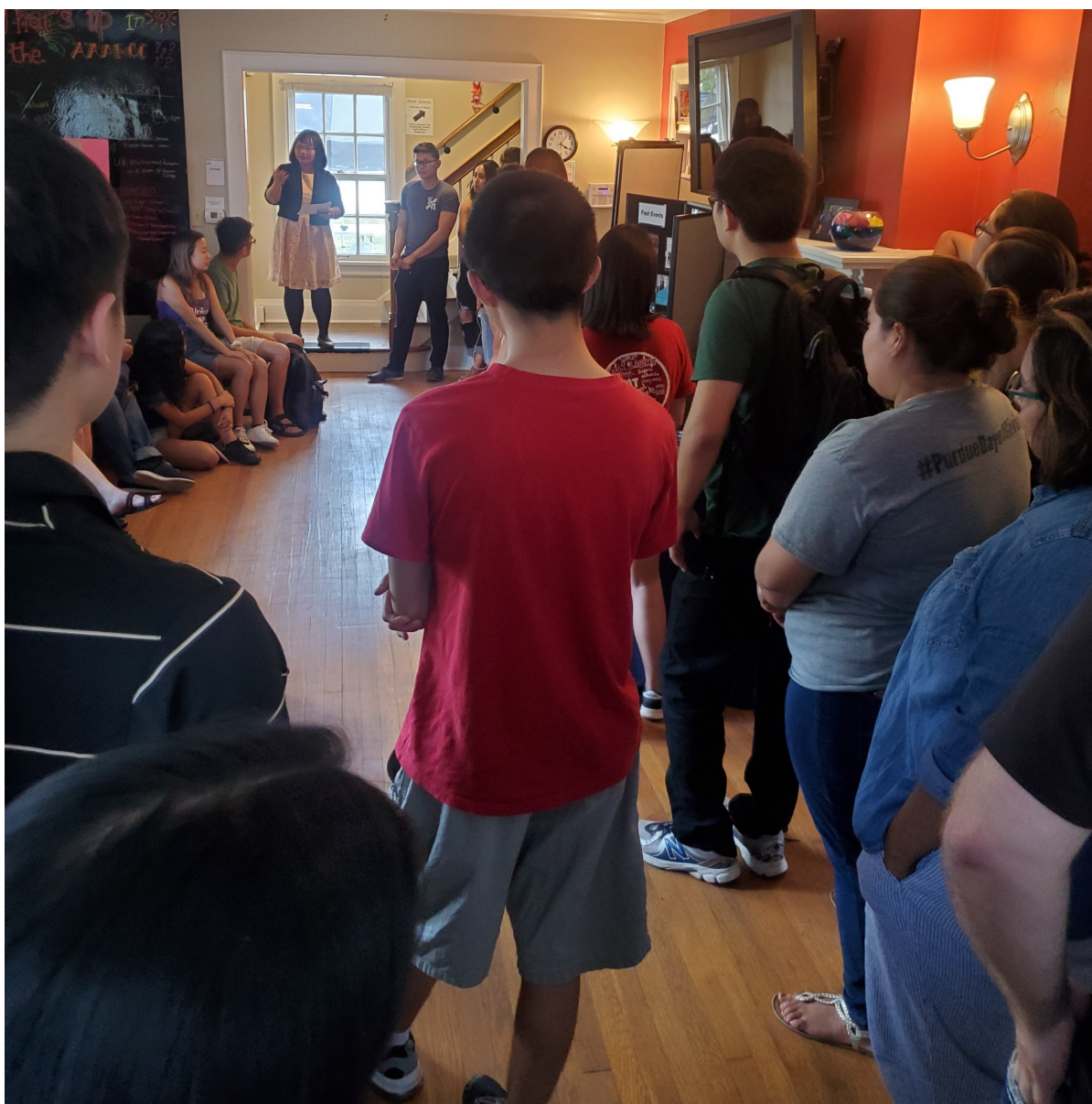
AAARCC Open House Held: 8/23/19