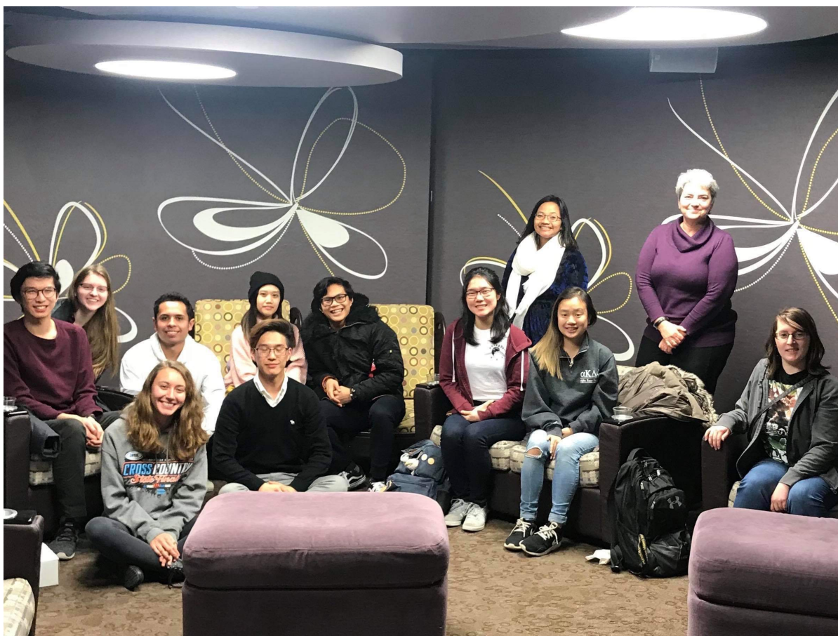
American Revolutionary: The Evolution of Grace Lee Boggs Held: 12/6/19

To round off the end of the Fall Semester, the AAARCC hosted an event celebrating the end of the semester and honor our Fall graduates.