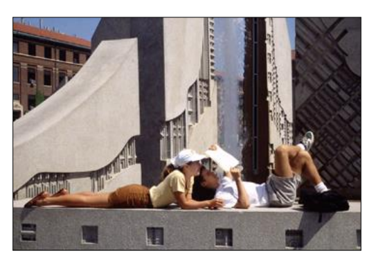
Students relax while studying at the Purdue Mall