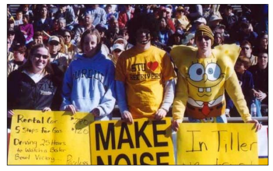
Purdue students cheer on the Purdue Boilermaker football team!

If students would rather compete than exercise, the Purdue Recreational Sports Center sponsors several club sports teams and organizes athletic tournaments every semester. The website for the various club sports at Purdue is: www.purdue.edu/recwell/programs/clubSports.