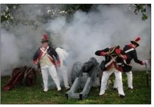
The Feast of the Hunters' Moon is a recreation of the annual fall gathering of the French and Native Americans which took place at Fort Ouiatenon, a fur-trading outpost in the mid - 1700s.

There are also special events and festivals that take place at Purdue and in the Greater Lafayette area every semester. The fall semester also includes fun and interesting events such as Global Fest (near campus at the Morton Community Center) during early September's Labor Day weekend, and the Purdue Homecoming Celebration and the Feast of the Hunter's Moon at Fort Ouiatenon in October. During the spring, Purdue's Spring Fest and the International Food Bazaar, both in April, are highly anticipated events