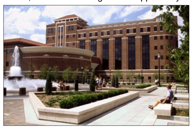
Founders Park with the Beering Hall of Liberal Arts in the background is a popular hangout area for students.

The Study Abroad Office holds a casual Welcome Reception each semester during the first week of class. We invite new incoming exchange students as well as Purdue students who have just returned from their own studies abroad. It is a wonderful way for students to mingle, share stories, and match faces with names! We will also invite you to join PASSPORT, a social group of exchange students and Purdue students who have studied abroad. Many fun activities are planned through PASSPORT, so take advantage of the opportunity!