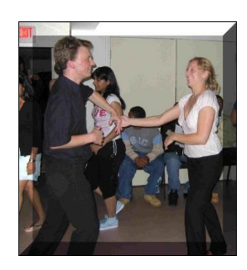
The International Center (IC) hosts a variety of cultural events and activities

The International Center (IC) in the Purdue campus also organizes several social events throughout the semester. Visit the IC website at: <a href="www.intlctr.org">www.intlctr.org</a>. More information on the arts and music scene in the Lafayette area can be found at: <a href="www.homeofpurdue.com/events">www.homeofpurdue.com/events</a>.