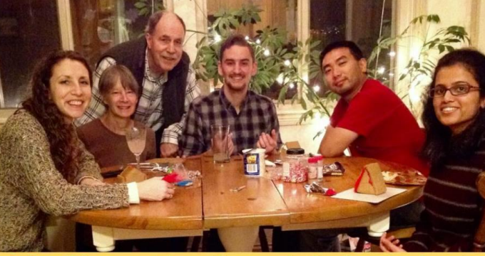
The Young Family and their students Making gingerbread houses!