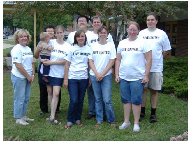
The crew of Space Management and Academic Scheduling helping out at Lafayette Adult Resource Academy.