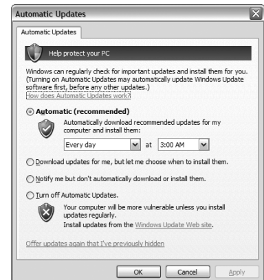
Steps 3 - 5