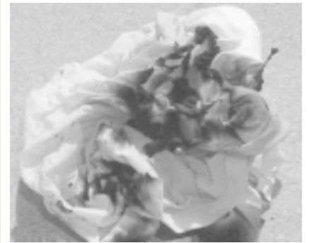
A rag (cotton T-shirt) that spontaneously combusted when crumpled and soaked with linseed oil.

I recently purchased outdoor furniture with a natural wood finish that requires periodic reapplication of linseed oil. The furniture manufacturer specified that the linseed oil be applied with a rag. Following this advice I applied the linseed oil as directed and placed the linseed oil soaked rag on top of the can in the garage. Two hours later I noticed the smell of linseed oil was very strong in the garage and noticed smoke billowing from the oil soaked rag. I removed the rag and placed it outside. I consulted the label on the linseed oil can and discovered that linseed oil oxidizes as it cures and produces heat which can result in fire. The directions on the can instruct the user to spread the oil soaked cloth outside on the ground so that it will more readily dissipate the heat before placing it in the trash.