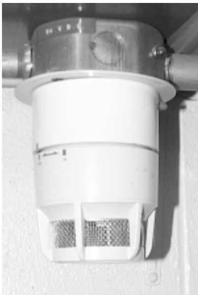
The Am-241 is used in "Ion-Chamber" type smoke detectors such as the one pictured here.

The Am-241 is used in ionization type smoke detectors. The Am-241 emits alpha particles and low energy gamma rays. The alpha particles are absorbed within the detector, as are most of the gamma rays.