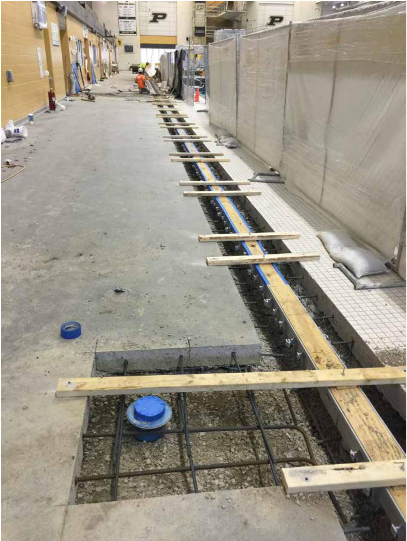
New drain system framed and set in place; new re-bar drilled into existing concrete and also laid around/under new drain.