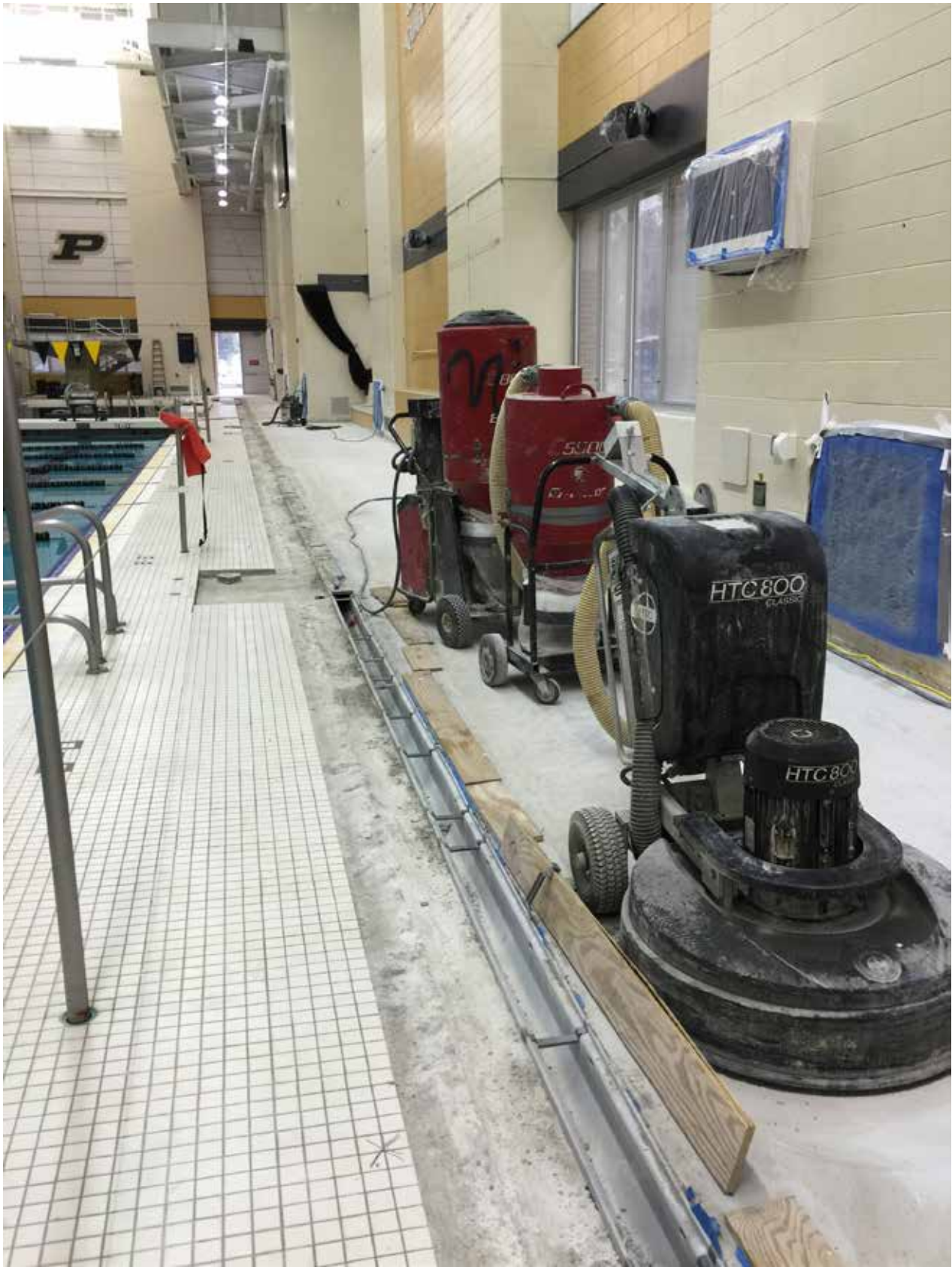
Sanding/scrubbing machine preparing for new epoxy floor