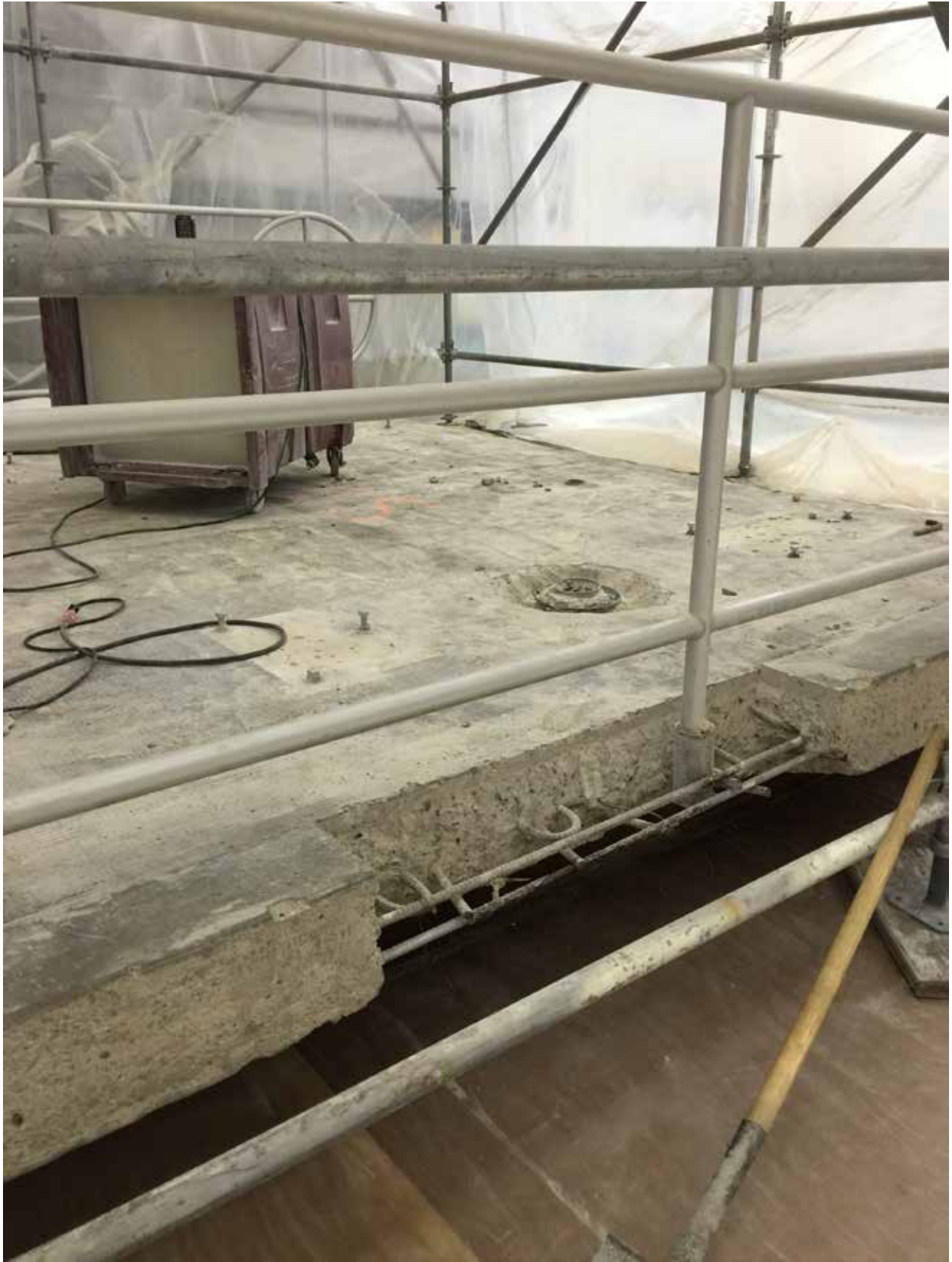
Portion of 1m springboard platform concrete removed and rebar trimmed back