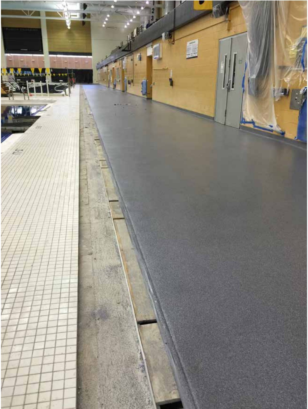
New epoxy floor