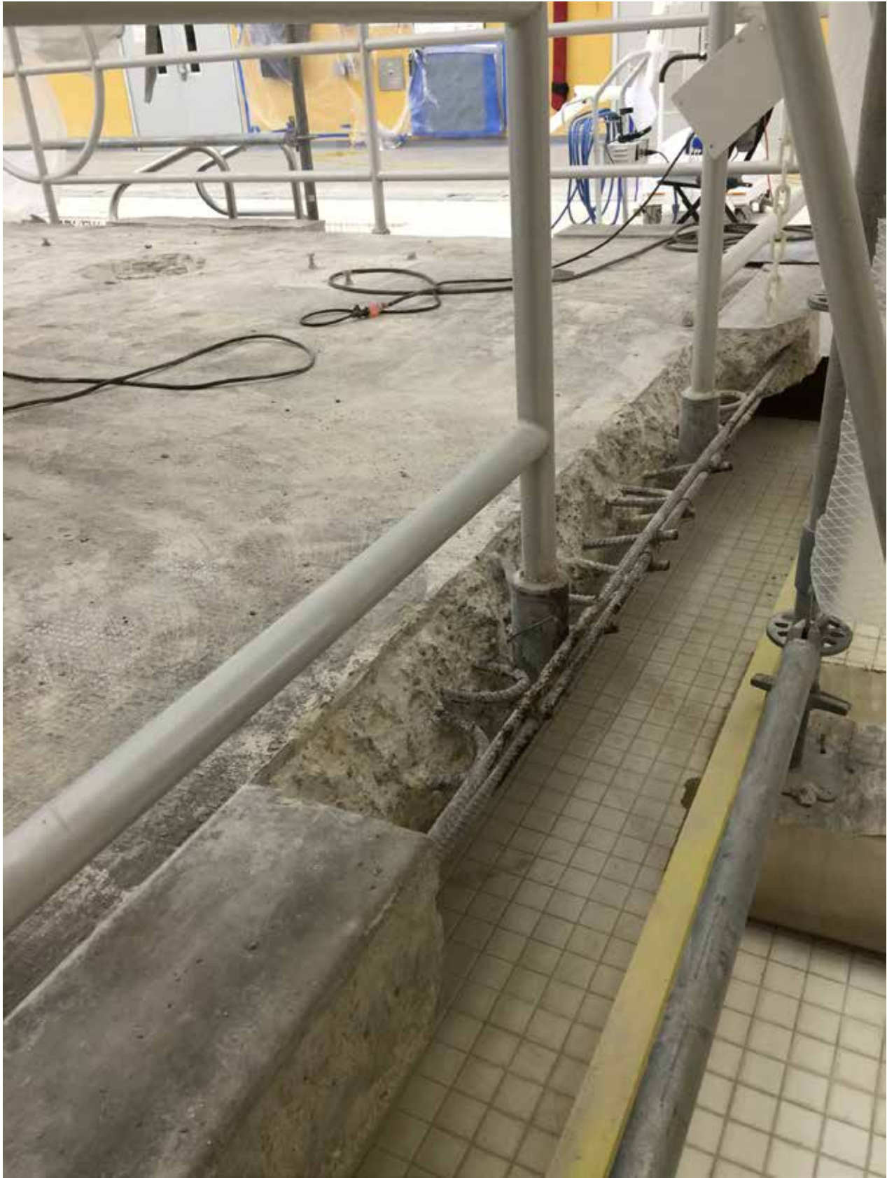
Another section of concrete on 1m springboard platform removed and rebar repair