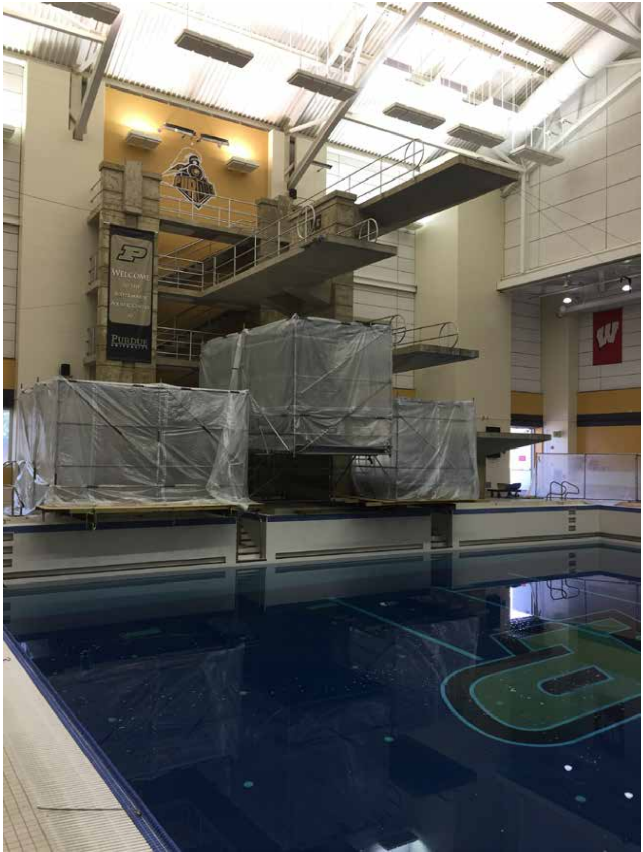
Dive Tower Prep