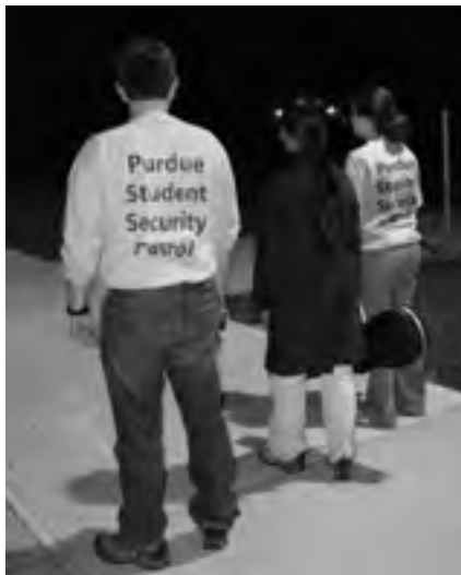
SAFE WALK PROGRAM Phone: (765) 494-SAFE (7233)

The Purdue University Citizens Police Academy gives participants a glimpse of life as a police officer. Class members range from Purdue students to senior directors and vice presidents at the University. One of the police department's most popular community outreach programs, the Citizens Police Academy, can accommodate up to 25 participants.