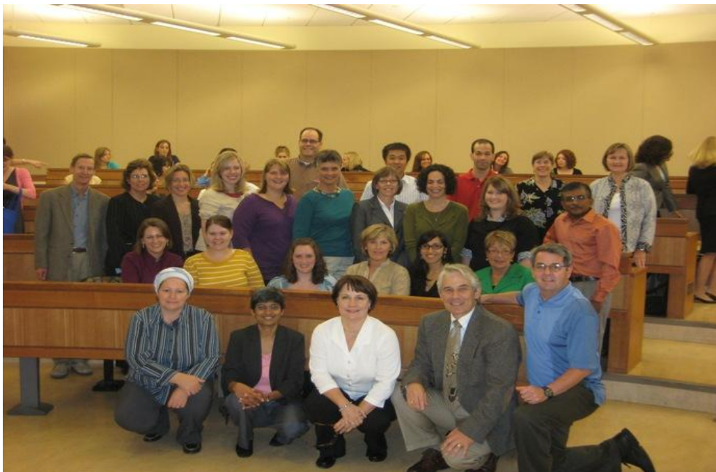
SLHS Faculty and students at the Ringel Student Research Symposium