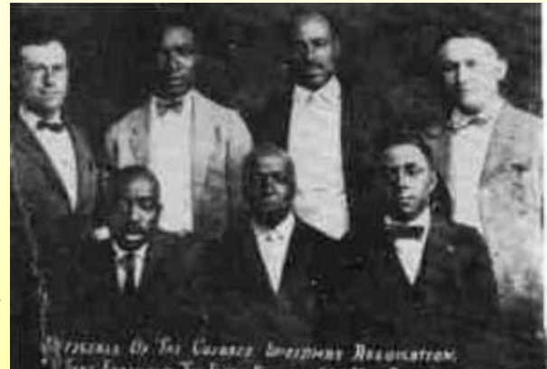
Colored Speedway Association officials, promoters of the Golden Glory Sweepstakes, Indianapolis