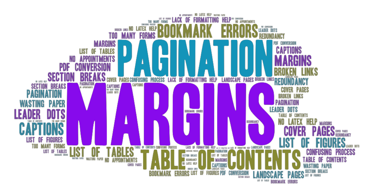
1 - Word Cloud: common deposit and formatting issues pre-2016.