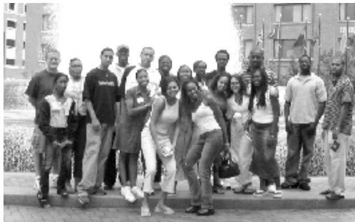
LSAMP at Indiana University, Bloomington

• When you assess your student, think about your value orientation and then consider, as you get to know your student, the student's value orientation. Having a dramatically different set of values might cause conflicts in doing research because values affect expectations for how the research and the relationship will develop. For example, your student might want you to be more directive, while you want them to take more of the initiative. Communicate honestly and openly and frequently!