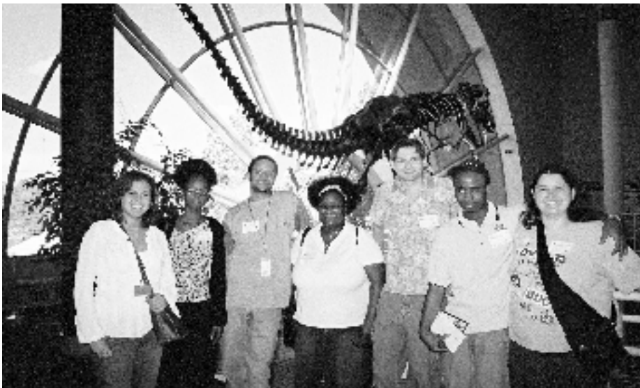
LSAMP at Indiana University-Purdue University, Indianapolis