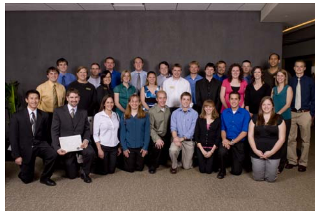
2008 Award Recipients (Click image for larger view)