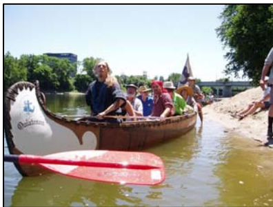
Wabash canoe trip visited by the Quiatenon Voyagers

We learned about the state of our rivers including water quality, fish and non-game species diversity and health, recreational opportunities, history and culture of Indiana's rivers, and the economic impact of our waterways. Evaluations show that 95% of participants rated the quality of information presented at the Rally as Excellent or Very Good. Governor Mitch Daniels proclaimed June as "Indiana Rivers Month," partly as a result of the excitement surrounding the first-ever Indiana Rivers Rally.