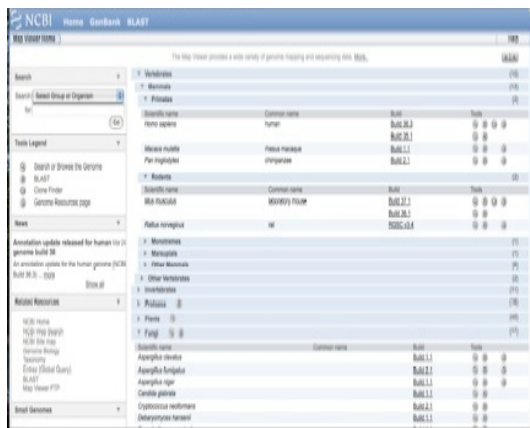
Figure 1. NCBI MapViewer

This section is divided into 3 subsections: descriptive results, including participant feedback about each interface, inferential statistical analyses of performance, and generation of new predictors of performance derived from psychometric measures.