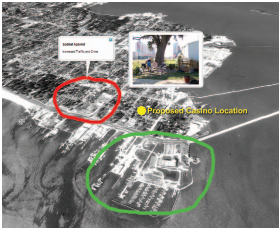
Figure 1. Multimodal geospatial annotations support spatial planning dialogue. The Gulf Coast community of East Biloxi, Mississippi experiences rebuilding challenges after Hurricane Katrina as the pressure to redevelop the city into a resort town grows. Many residents are unable to afford the cost of rebuilding their homes and have been forced to sell their land. Colour-coded line annotations are used to point out areas of redevelopment and changes in cultural community character. Green annotations signify 'go' to move forward with development of casinos. Red annotations signify 'stop' building casinos. Text annotations provide geospatial arguments (increased traffic and crime) to support positions. Photographs capture primary data from fieldwork and provide detailed information related to discussion about a place. Source of East Biloxi peninsula image data: NASA WorldWind, US Geological Survey. Our initial tools have been implemented by adding extensions to Google Earth. Owing to copyright issues with both images of the Google Earth viewer and the content it displays, we are illustrating the ideas with figures created using open-source web tools and data.

The design of any visual-analytical tool needs to be properly grounded in a relevant theoretical framework so that empirical testing of goals can be achieved. We introduce a perspective from group communication theory, the Collective Information Sharing (CIS) bias, as an approach through which geospatial annotation tools can enable collaborative discussion. We apply the CIS bias theory to develop guidelines for effective map annotation. Meaningful knowledge production emerges from the pooling of unique information. The CIS bias theory focuses particularly on the importance of harnessing collective knowledge from group discussions by minimizing the sharing of redundant information and increasing the sharing of unique information. Empirical group research guided by the CIS bias theory has shown that group members tend to repeat shared