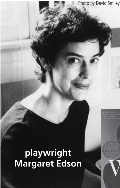
playwright Margaret Edson