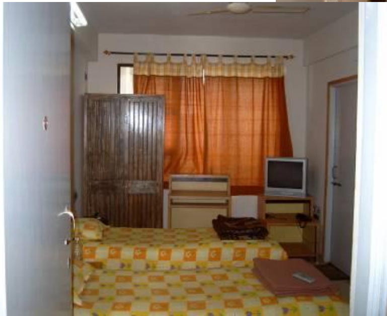
Guest House: Rooms