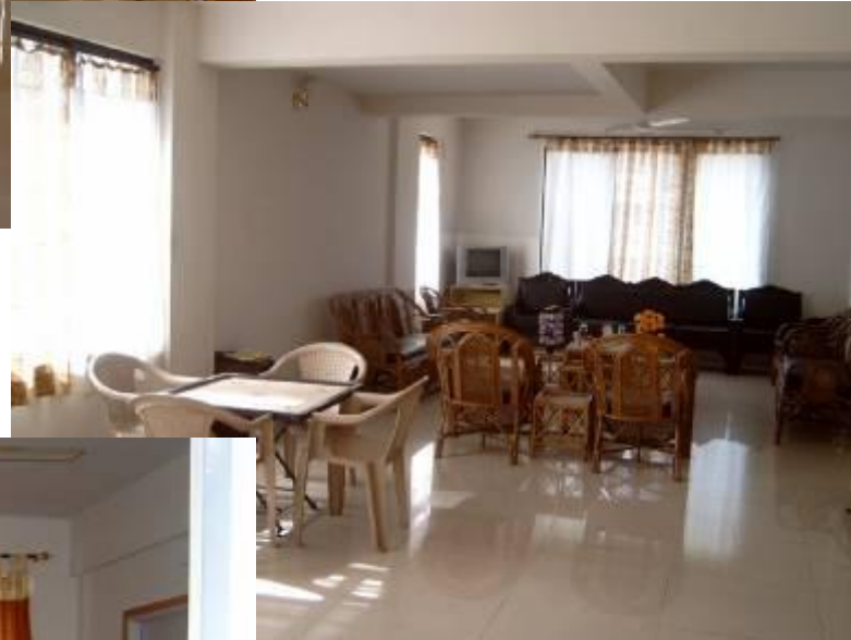
Guest House: Recreation Area