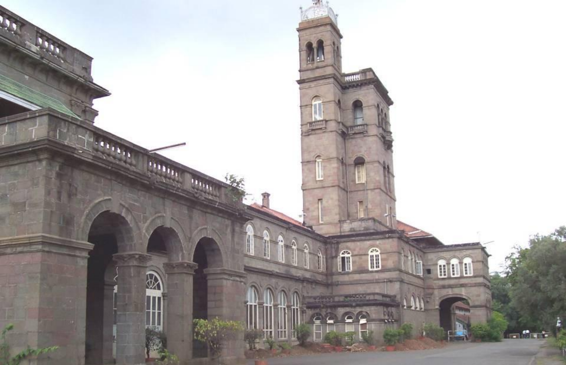
University of Pune