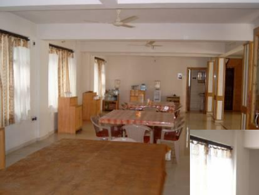
Guest House Dining Area